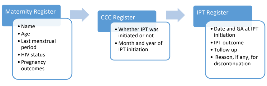
Figure 1: Overview of chart review for data collection with relevant information from each